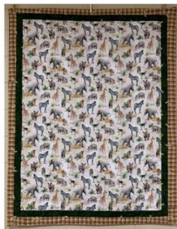
Pieced and quilted by LCGS Quilters 50" x 64"