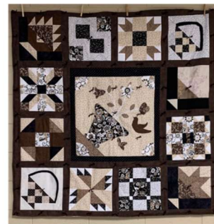
Pieced and quilted by LCGS Quilters 59" x 59"